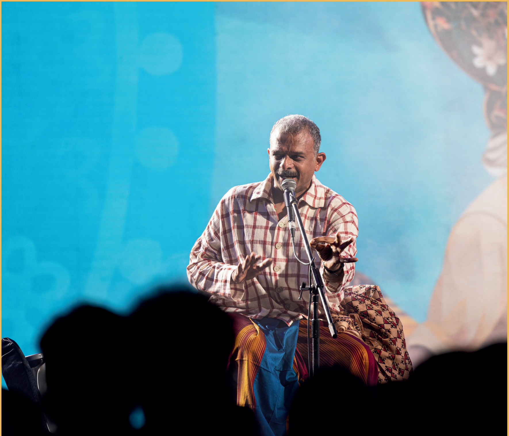
Shri T.M Krishna Indian Vocalist and Author