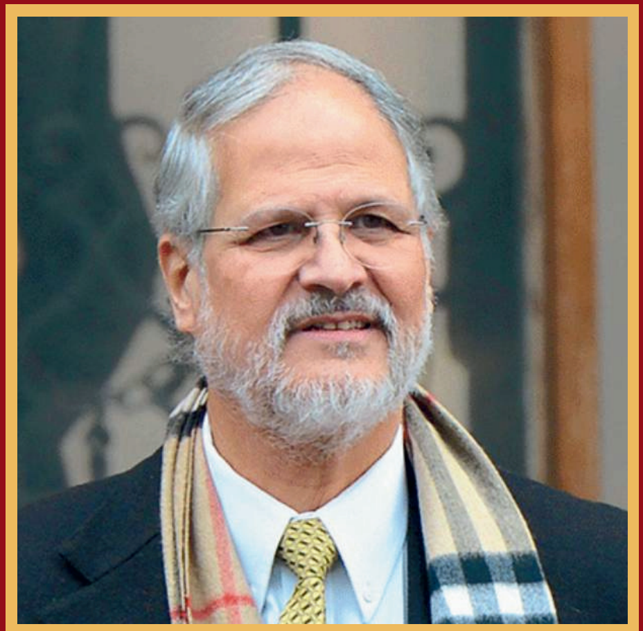
Chair Najeeb Jung Former Lieutenant Governor of Delhi