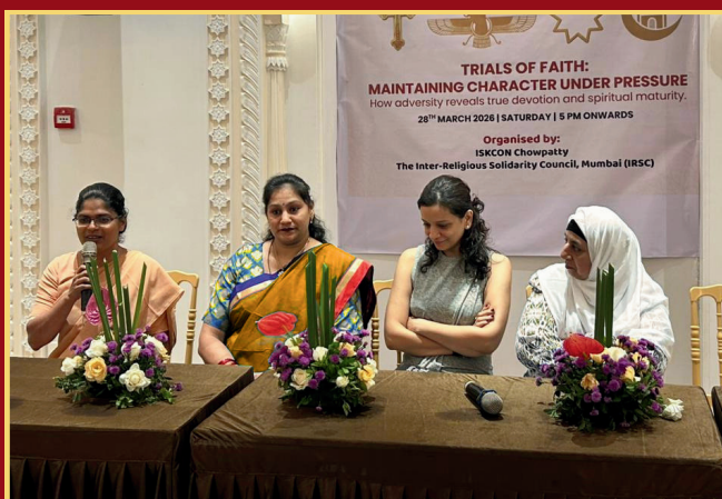
Thematic Panel Discussions