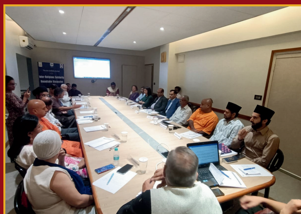
Interactive Dialogue Sessions