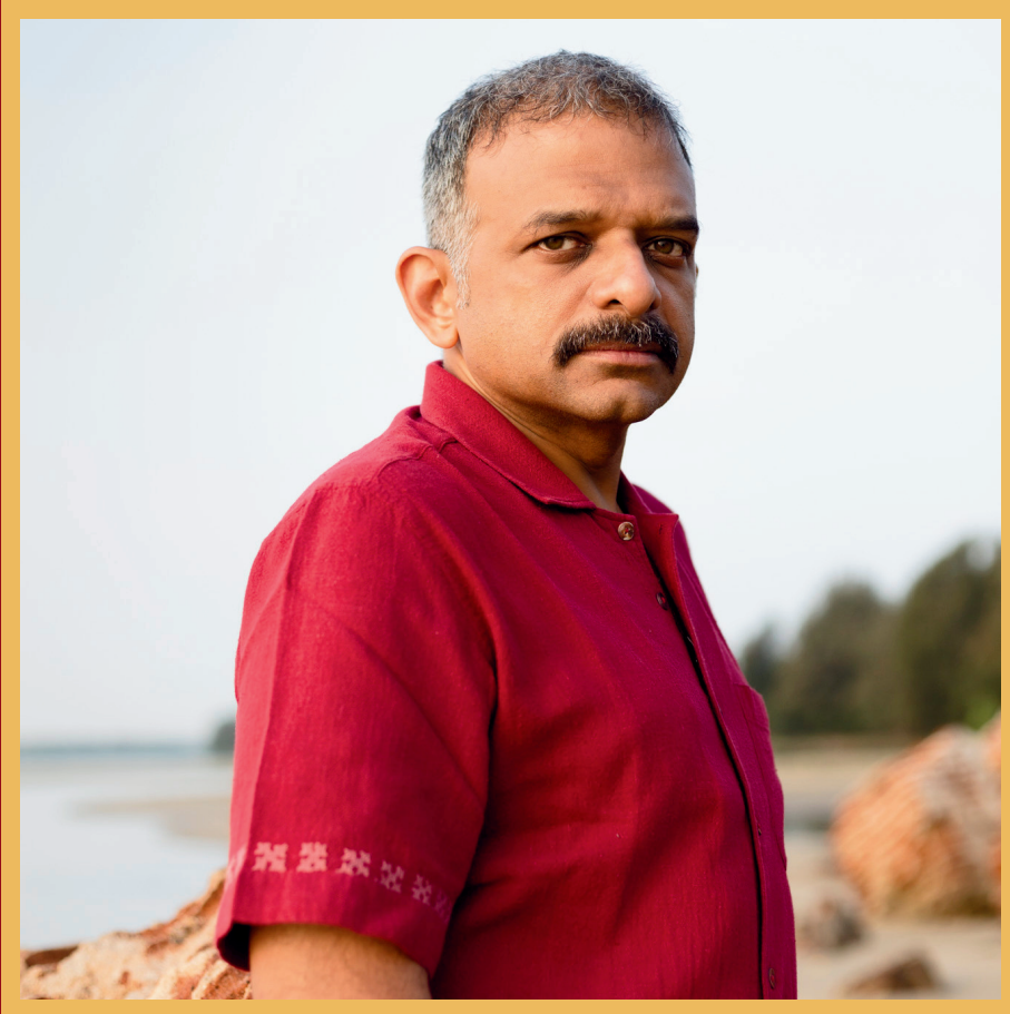
Speaker Shri T.M Krishna Indian Vocalist and Author